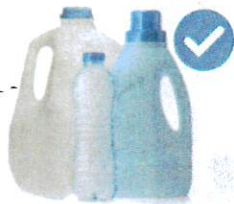
Plastic Bottles & Jugs